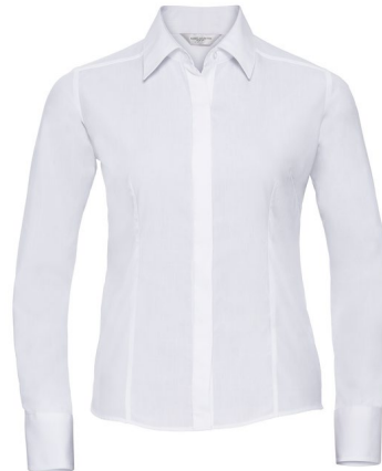
RUSSELL White Long Sleeve Blouse