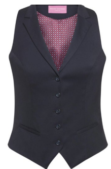
LARISSA Tailored Fit Waistcoat