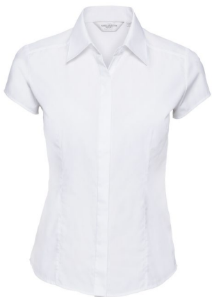
RUSSELL White Cap Sleeve Blouse