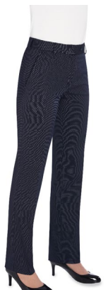
BIANCA Tailored Leg Trouser