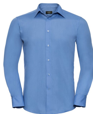
RUSSELL Corporate Blue Long Sleeve Polycotton Poplin Shirt