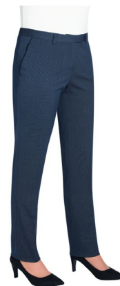
OPHELIA Slim Leg Trouser