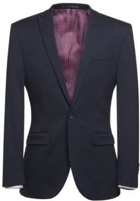
PEGASUS Slim Fit Jacket