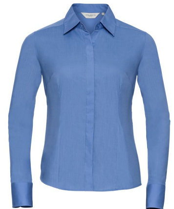
RUSSELL Corporate Blue Long Sleeve Blouse