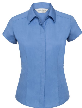
RUSSELL Corporate Blue Cap Sleeve Blouse