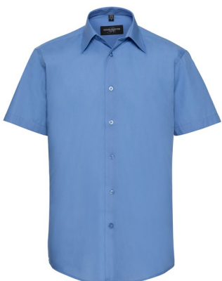
RUSSELL Corporate Blue Short Sleeve Polycotton Poplin Shirt