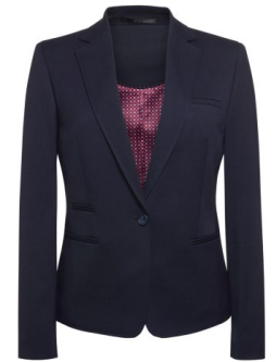
ARIEL Slim Fit Jacket