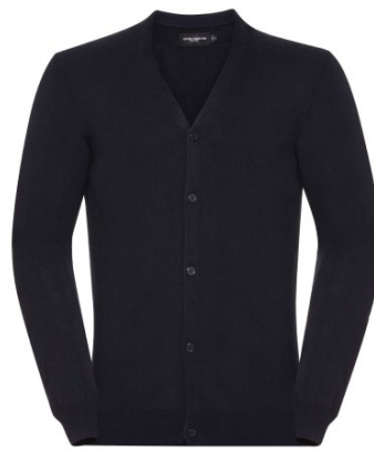
RUSSELL Men's V-Neck Jumper