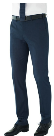
PEGASUS Slim Fit Trouser