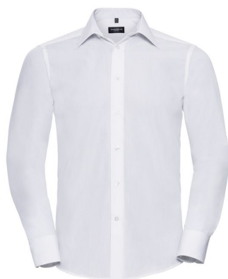
RUSSELL White Long Sleeve Polycotton Poplin Shirt