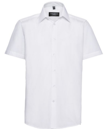
RUSSELL White Short Sleeve Polycotton Poplin Shirt