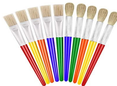
* large paintbrush