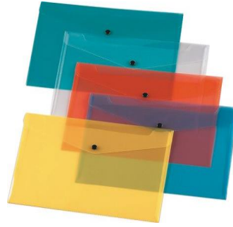
*A4 Envelope folders for worksheets and reading books