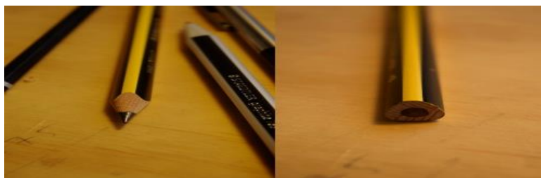
*Year 1 chubby triangular pencil