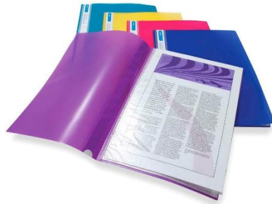
*A4 display folder

All the above are to be labelled. The boys should bring these to school on the first day.