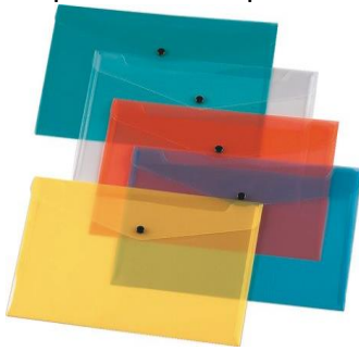
*A4 Envelope folders

All the above are to be labeled and put in a shoe box with name and class on it, to be kept in the art room.