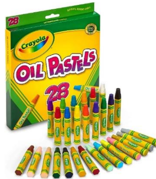
*Crayons oil pastel