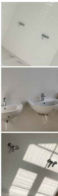
Some of the new bathrooms and showers as they were being installed

Over the summer months the boarding section of the College has been a hive of activity. One of the main targets of the activity was the bathrooms and showers. Under the eagle eye of Leanda Keith, our Boarding Manager, all nine bathrooms were given a complete makeover and now boast some of the latest Italian designed tiles and ceramics. The colour scheme has been lightened and the rooms are now as light and bright as the sunlight outside.