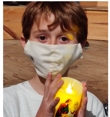
The light of the world is born