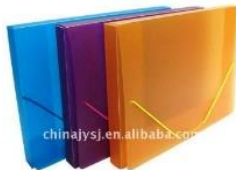
* Box files