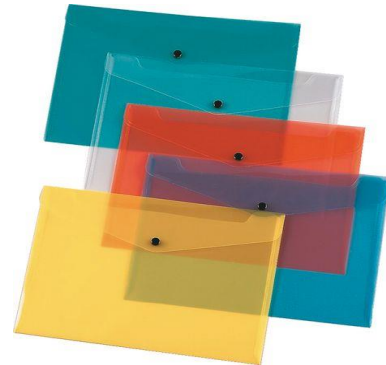
*A4 Envelope folders