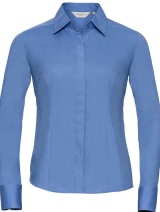
RUSSELL Corporate Blue Long Sleeve Blouse