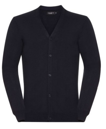
RUSSELL Men's V-Neck Jumper