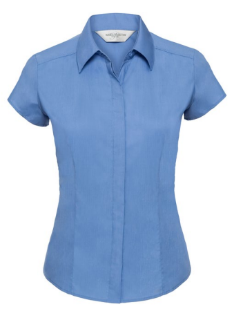
RUSSELL Corporate Blue Cap Sleeve Blouse