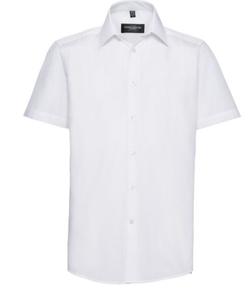
RUSSELL White Short Sleeve Polycotton Poplin Shirt