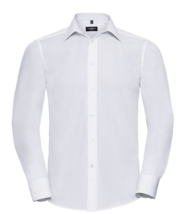
RUSSELL White Long Sleeve Polycotton Poplin Shirt

RUSSELL Corporate Blue Short Sleeve Polycotton Poplin Shirt